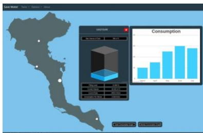
Figure 4: User Interface.

The collected data is presented by a user interface (UI), with the aim of directly informing all interested parties. Accordingly, a web-based platform with this UI has been created the also offers early warning in the event of a leak in the network, risk of tank overflow, or lack of water for a monitored tank. Figure 4 shows a map of Corfu Greece, and the registered / monitored water storage tanks. When a water tank is selected, a new pop-up html entity emerges and the attributed of the water tank are detailed. These attributes include the maximum volume of the tank, the current filling level as a percentage and in absolute value, as well as the current rate (in-flow) and consumption (out-flow) per minute. Along this data, a graph is shown indicating the monthly consumption of the selected water tank for reference purposes.