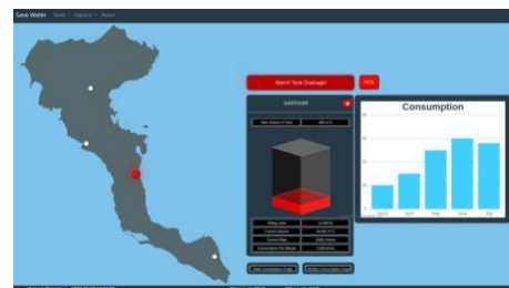
Figure 5: User Interface's Alarm.

In addition, the user can designate the maximum and minimum level of water to indicate the event of a tank overflow or lack of water, for the necessary alarms to be activated, as shown in Figure 5. Following the initiation of the alarm, a sound is heard so users can be notified and act accordingly.